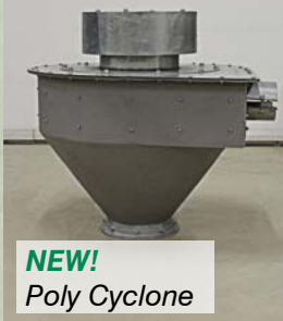
NEW! Poly Cyclone

Galvanized 30" Dia. Cyclone is lined with long-lasting UHMW to protect the grain as it decelerates. All-galvanized construction and 11 ga. steel lining on the cone ensure long life. The Sukup cyclone is 66% larger than competing cyclones. The large diameter handles larger volumes of grain with less wear.