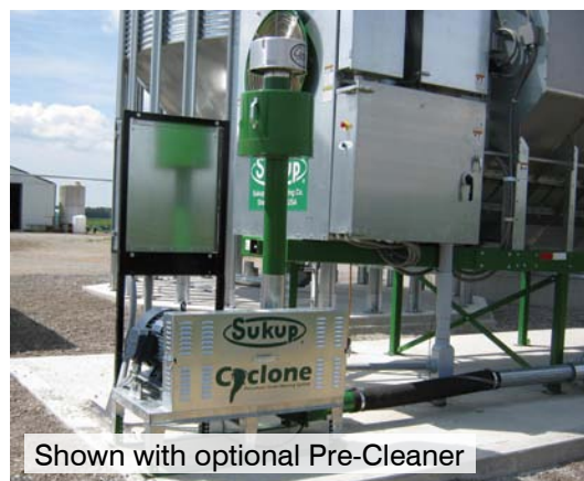
Shown with optional Pre-Cleaner

The Rotary Airlock used on Sukup Cyclone Systems is heavier and built better than any other available, resulting in longer life. The thicker vanes eliminate the need for adjustable tipped vanes.